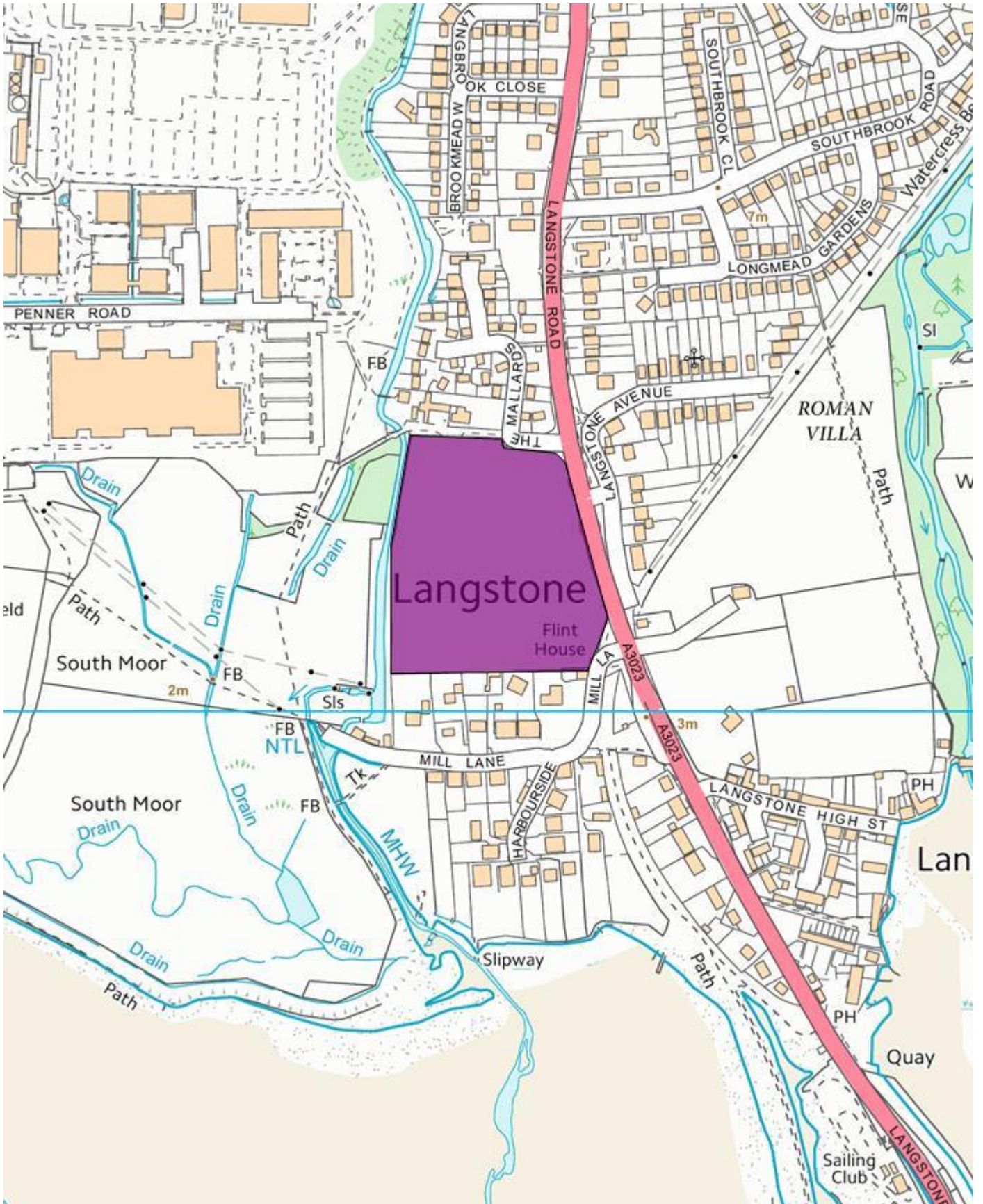
UE54 Southmere Field, Langstone Road